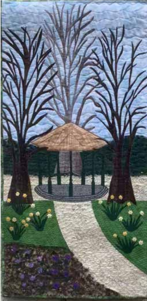
Fiona Lennon IPS Leave Only a Footprint

My quilt is based on a walk I do most weeks in St Helena's Park. Springtime is one of my favourite times and I have used raw edge appliqué and confetti to capture the park, quilted on my domestic sewing machine with some of the preset stitches.