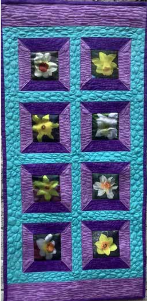
Suzanne Pass IPS Operation Daffodil

Daffodils symbolise the coming of Spring. I enjoy going of a walk in the park with my camera to capture the daffodils.