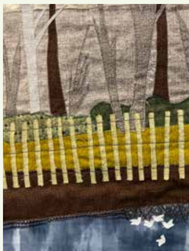
A walk with a friend in Victoria Park Belfast.