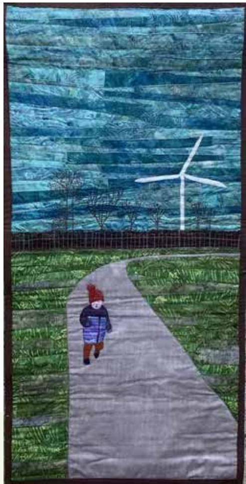
Louise Coburn IPS Am I Finished Yet?

I was inspired by the concentration of a toddler at my local weekly park run in Dundalk, who was totally absorbed in what they were doing.